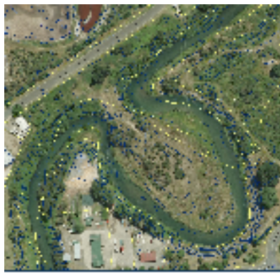
The Site, on Spencer Av, Kawerau.

The land transfer has finally been completed and the reserve land has been formally 'vested in trust' in the Kawerau District Council (KDC). We still require the Minister of Conservation's Consent before we can finalise the Lease agreement with KDC.